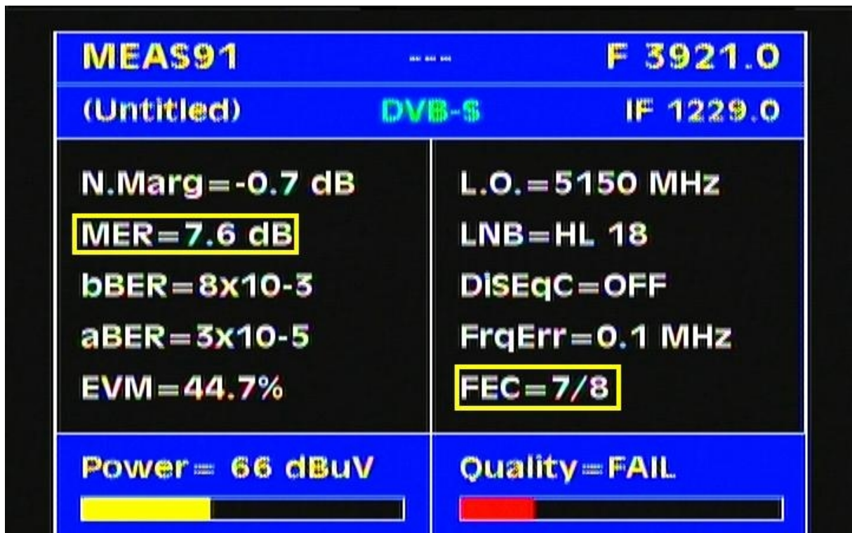
C-ID locking level by FEC 7/8 >> MER=6,0 dB / constantly oscillating MER peak <<6,0 - 8,5+ dB