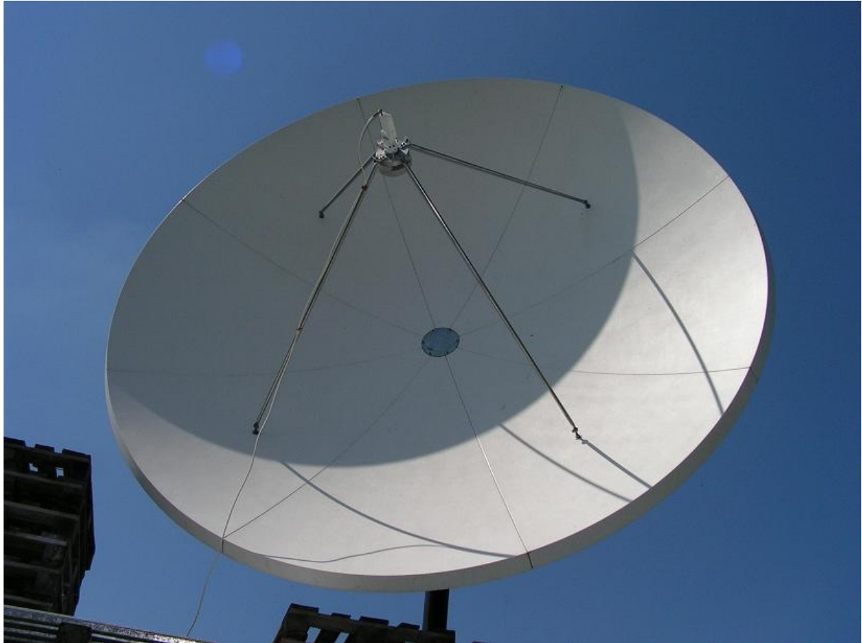
PF Prodelin 3.7 m at 91,5°E