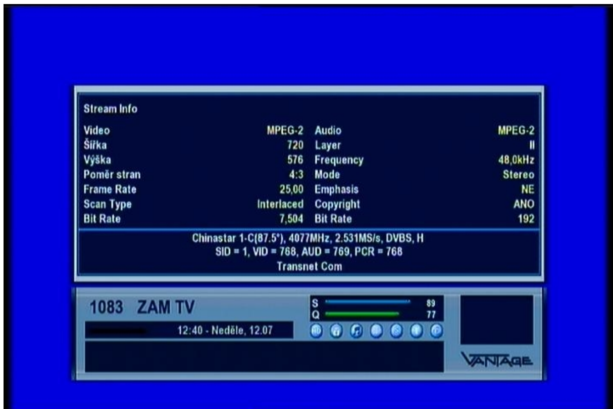
Zam Tv _ without regular service